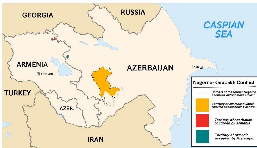
Figure 2: Territorial Overview of the Nagorno – Karabakh Conflict

competing, utilizing drone warfare and alliances with Turkey and Israel. Armenia’s reactive and rigid competing strategy, without modernization or strong partnerships, proved inadequate. As Azerbaijan gained the upper hand, it shifted toward collaborating and compromising through ceasefire negotiations and post-war arrangements. Armenia, in contrast, slid into forced accommodation and eventual avoidance, failing to influence outcomes. This phase-wise analysis highlights how timely and adaptive use of conflict styles particularly Azerbaijan’s strategic flexibility can significantly shape conflict outcomes, while rigid or delayed responses, as seen with Armenia, limit influence and success.